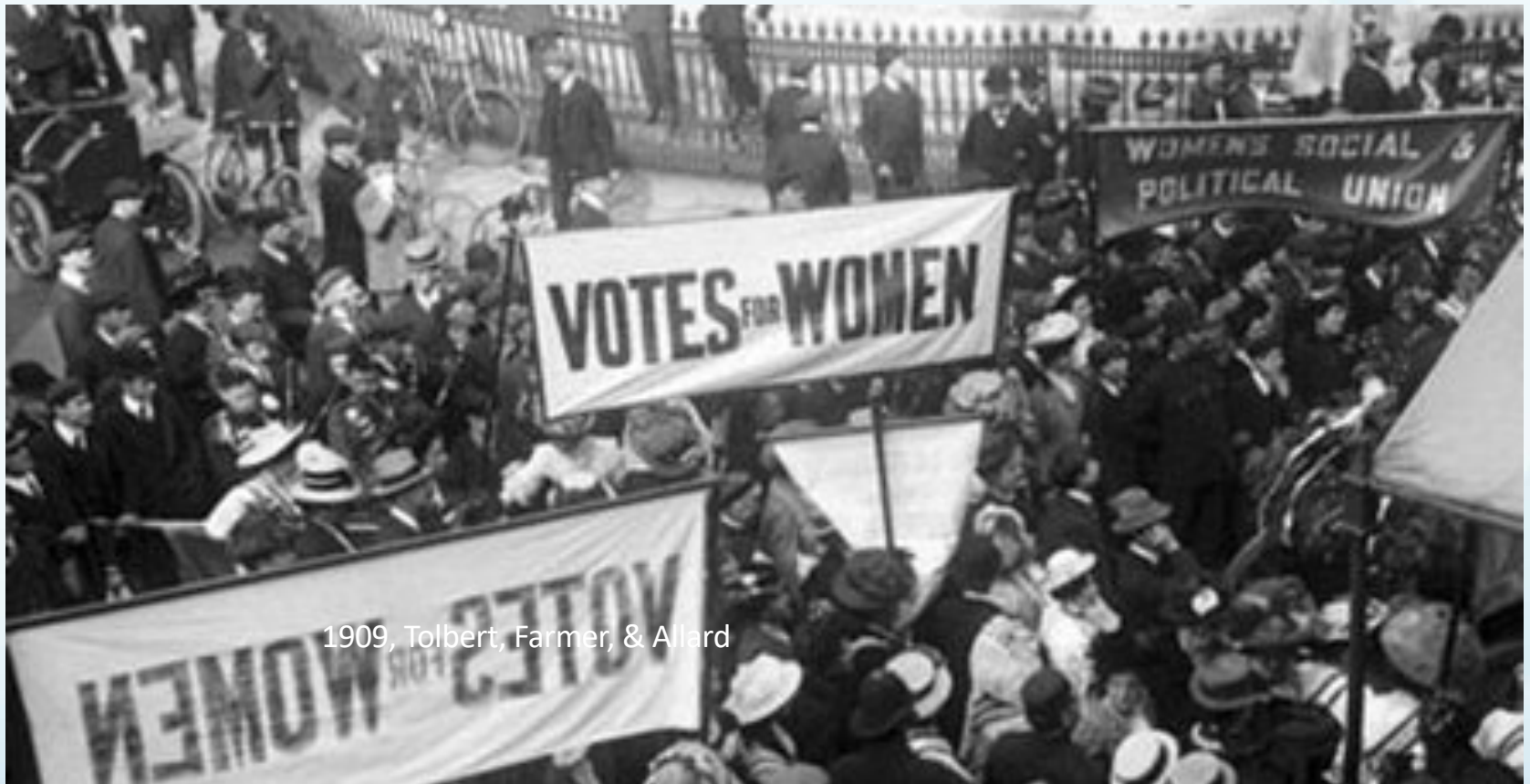
1909, Tolbert, Farmer, & Allard

МСМС появился и вырос на оживленном перекрестке прав женщин, социального прогресса и реформы здравоохранения.