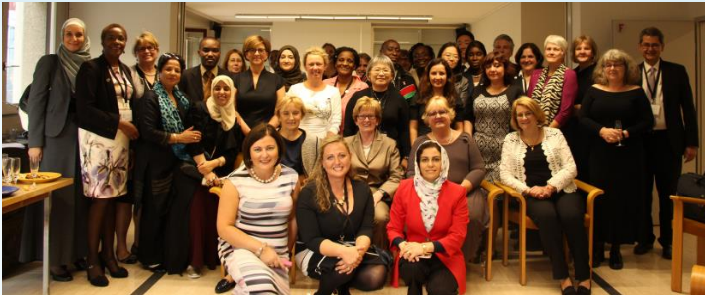
Глобальный институт сестринского лидерства